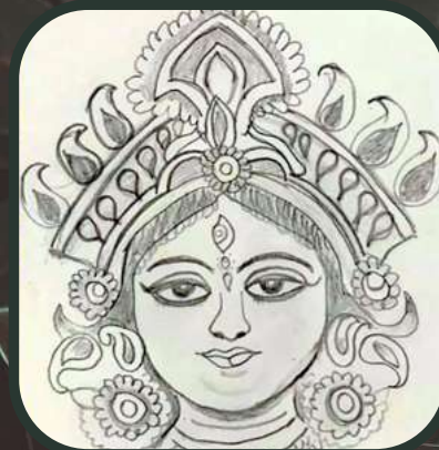
Punya K P