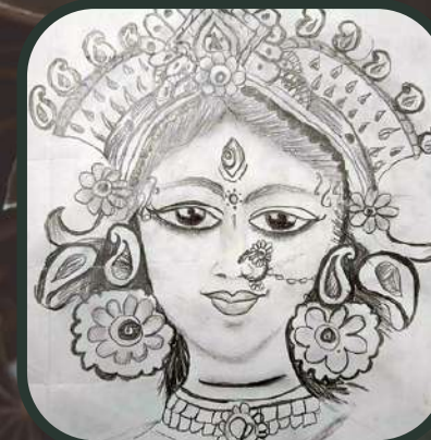
Amrutha B S