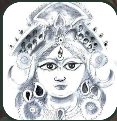
Aarush B Krishnan