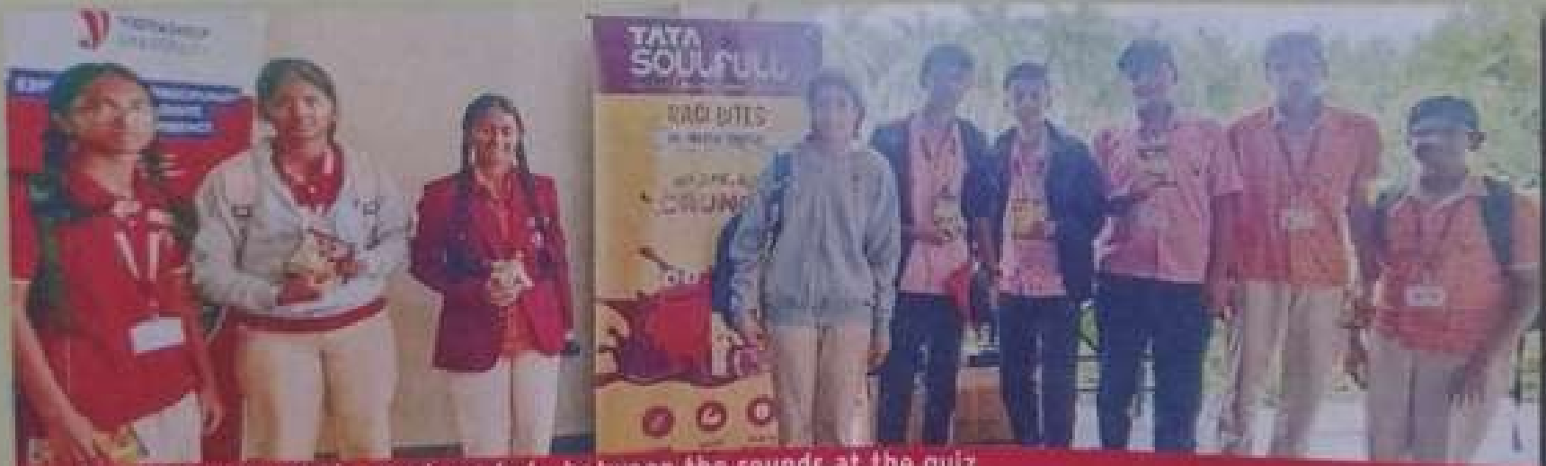
Students enjoy their snack packets between the rounds at the quiz